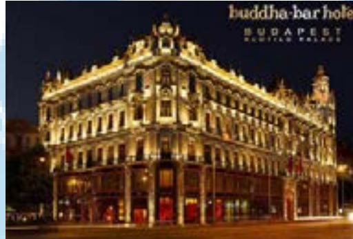
Buddah-Bar Hotel (5 stars) / Hungary