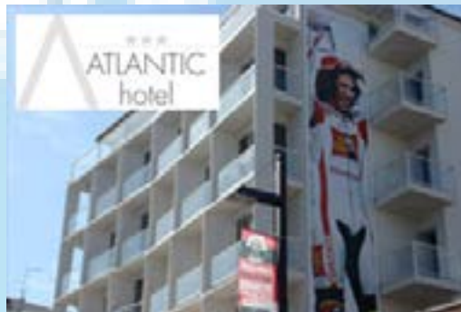
Atlantic Hotel (3 stars) / Gabicce (PU)