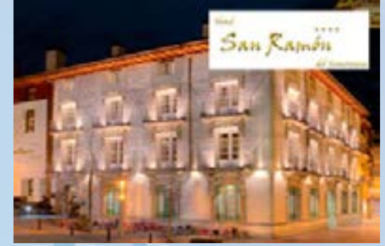
San Ramon (4 stars) / Spain