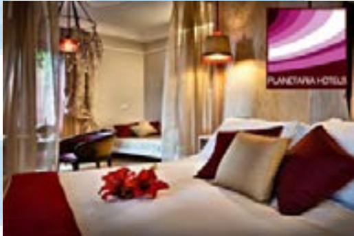
Chateau Monfort (5 stars) / Milano