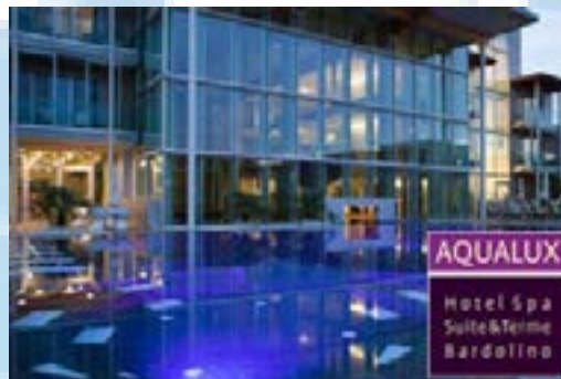
Aqualux Hotel (4+ stars) / Verona