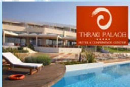
Thraki Palace (5 stars) / Greece