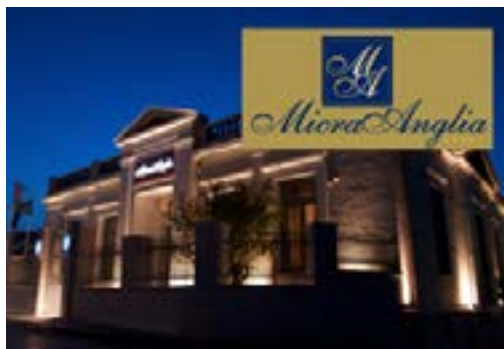
Micra Anglia (5 stars) / Greece