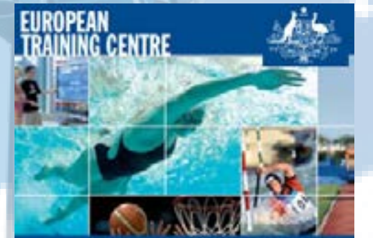
European Training Center / Varese