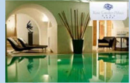
Rose Garden Palace (4 stars) / Roma